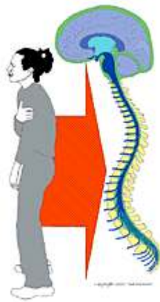
Figure 1: (left) Irritation and abnormal activity of pain-processing elements and circuits throughout the body and nervous system contribute to chronic pain. Chronic pain has a multitude of causes, including congenital disorders, spinal disorders, musculoskeletal imbalance, compensatory patterns, surgery, scar tissue, disease processes, trauma, infection, overuse, disuse and misuse. "The common denominator of conditions that cause chronic pain is irritation of the nociceptive (pain cell) endings, axons, or processing circuits causing abnormal activity that is interpreted as pain." 2

CranioSacral Therapy can be used to identify and help the body change core patterns contributing to chronic pain. It also effectively addresses its associated symptoms, such as musculoskeletal imbalance, trigger points, myofascial dysfunction, chronic fatigue, immune system dysfunction, autonomic nervous system dysfunction, elevated heart rate, high blood pressure, endocrine system dysfunction, stress, anxiety, hypothalamic dysfunction and sleep difficulties.